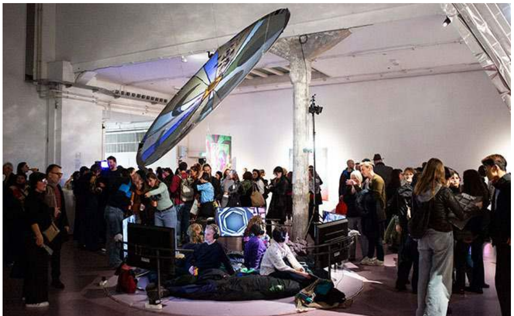
The opening at W139 for Taking Root Among the Stars .