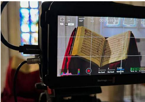
Behind the scenes for the recording session at Boston College by Cappella Pratensis, in which the vocal ensemble performed from the 1546 original copy of Jacques Moderne's print of Cristóbal de Morales' Missarum liber primus