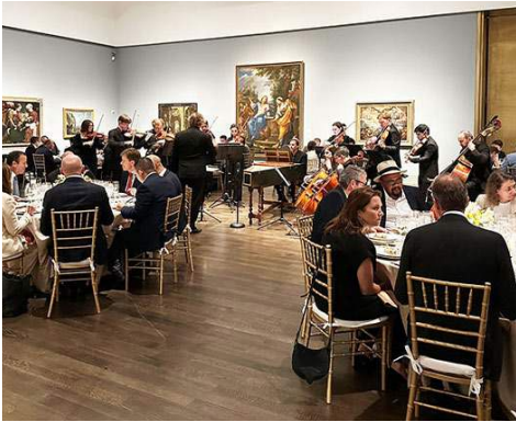
The September dinner for members ING, Dentons, and Vopak

As the capital of traditional and new energies, Houston remained booming in 2024. The chapter realigned its goals toward corporate events and the creation of internship opportunities in the various sectors. Often overlooked, Houston is also home to the largest medical center and continues to host a thriving space industry.