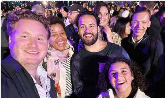
NAF alumni and Fulbright students at opening night of the Royal Concertgebouw Orchestra in September

The NAF Netherlands Chapter started the year with the traditional NAF Connection Event on March 15 at Capital Kitchen, giving the US Fellows-in-residence and Dutch2USA alumni the opportunity to share their experiences.