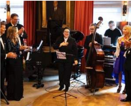
Photos from the Netherland-America Frienship Gala, Royal Industriële Groot Club, June 15, 2024.