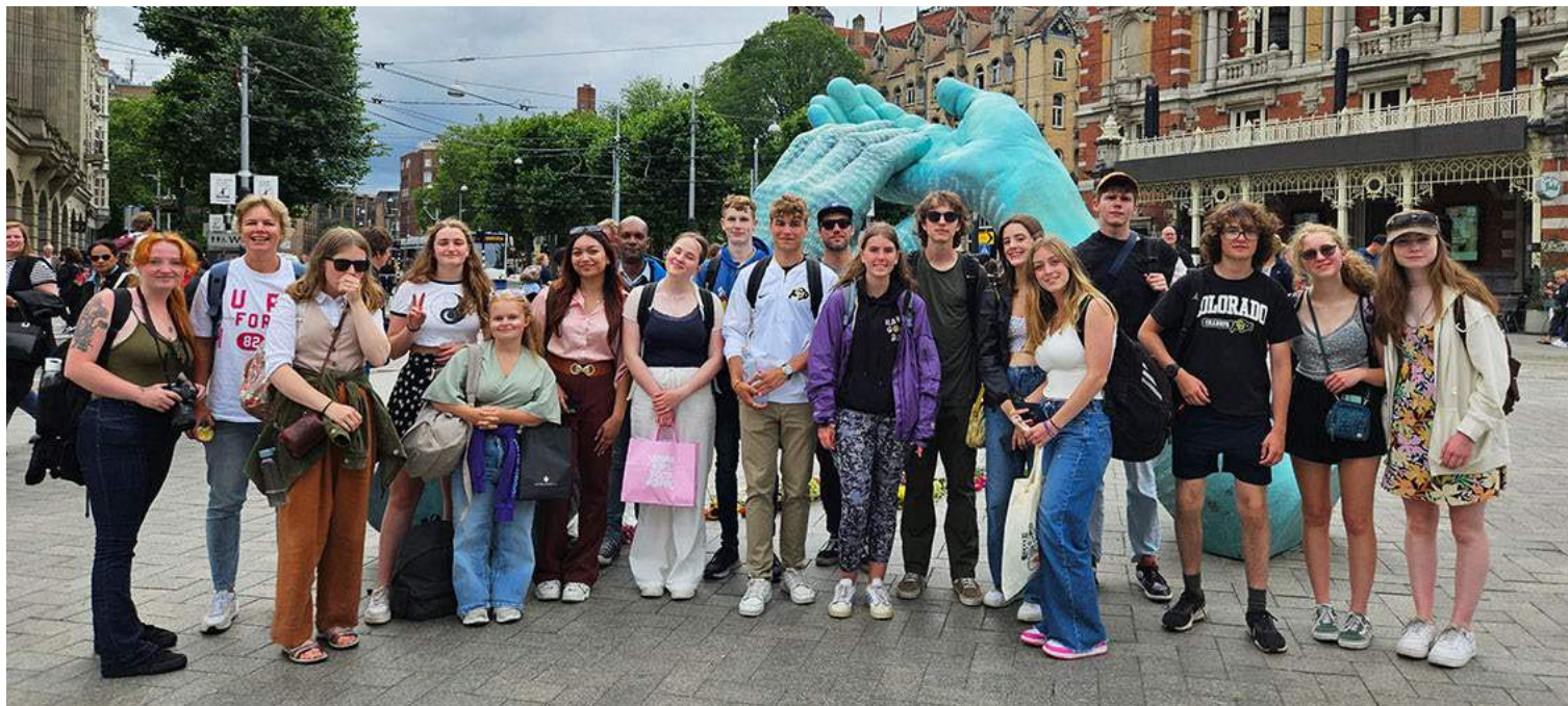
The Going Dutch delegation in Amsterdam in front of the Peter R. de Vries memorial sign