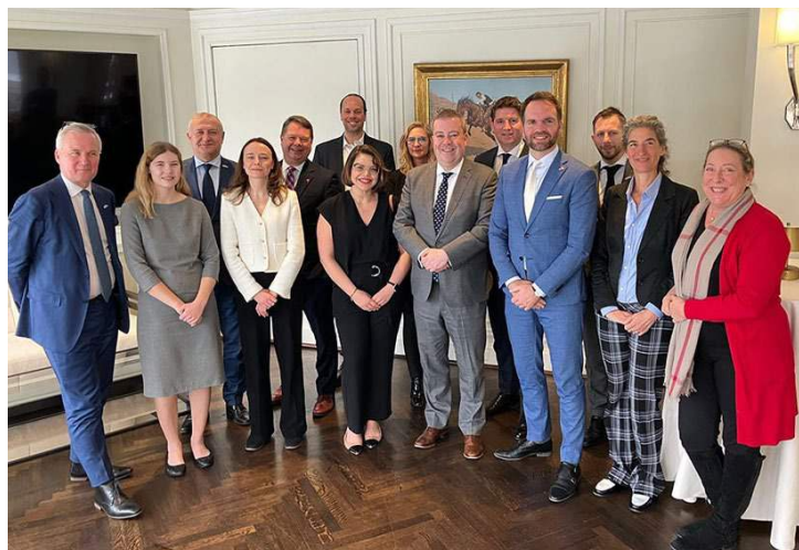
The Washington, D.C. chapter meeting with Dutch Members of Parliament