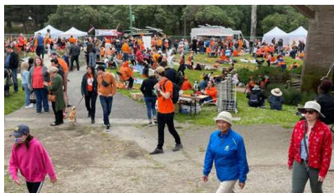
Guests gather at NorCal's 2024 Kingsday event