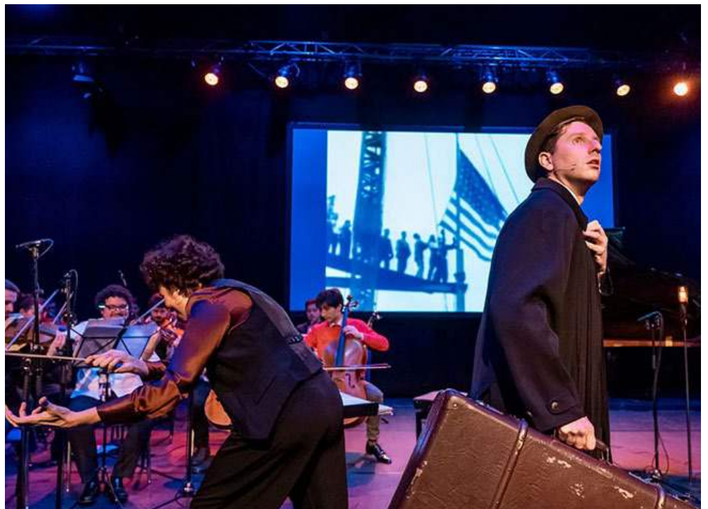
Performance and poster for "I Got Rhythm," celebrating the 100th anniversary of George Gershwin's most famous composition, "Rhapsody in Blue".