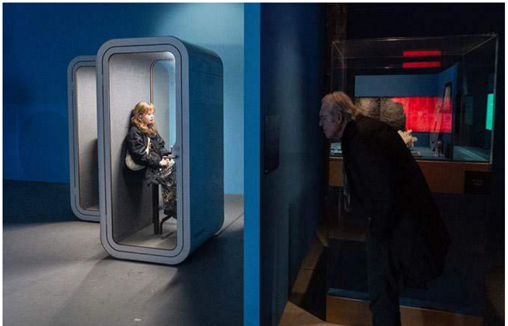
Poetics of Prompting by The Hmm and MU.

MOTORMOND is a blackqueer exhibition space circulating critical pan diasporic culture. Their exhibition, Archiving Re.existence , dove into the archives of Festac 1966, PANA Algiers 1969, Zaire 1974 and Festac 1977, for images, posters and speeches, and music. They were then brought into conversation with contemporary artists in the Dutch context who were commissioned to make work that investigates pan diasporism around themes of play, opulence, indulgence and spirituality as scenes of diasporic gathering.