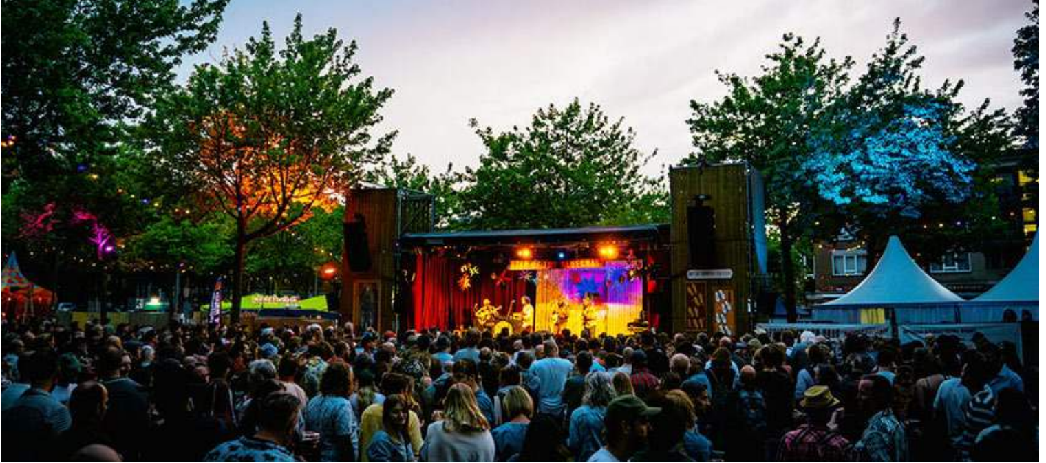
Rotterdam Bluegrass Festival: The Dirty Grass Players