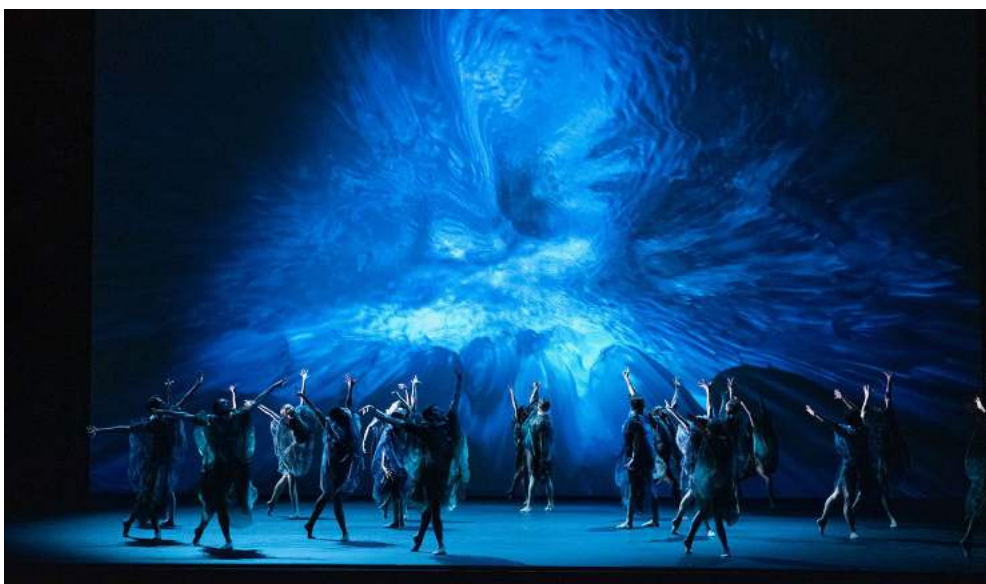
Artists of Boston Ballet in Nanine Linning's La Mer , performed at the Citizens Opera House