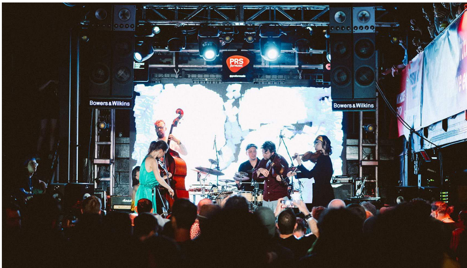
The Dutch modern-classical ensemble Fuse at South by Southwest Festival in Austin, Texas