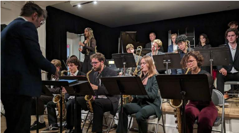
The Jazz Focus Big Band performance at Greenwich House Music School in New York City