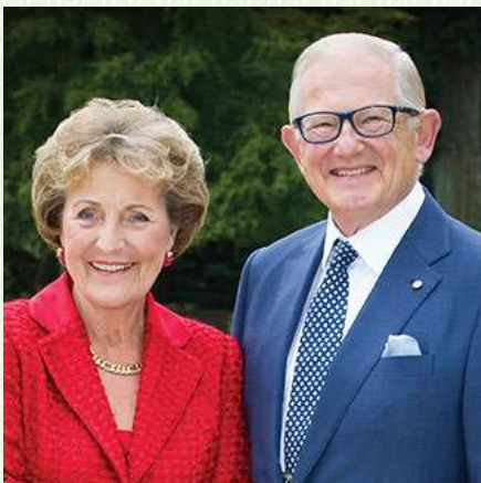
Under the Patronage of Her Royal Highness Princess Margriet of the Netherlands and Professor Pieter van Vollenhoven