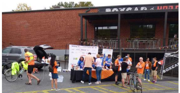
Riders and participants in the NAF-Atlanta Annual Bicycle Tour.