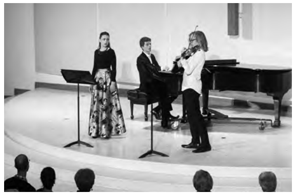
Princess Christina Concours Concert at First Presbyterian Church, Santa Monica.