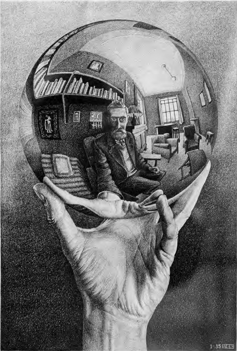
M.C. Escher, Hand with Reflecting Sphere, 1935.