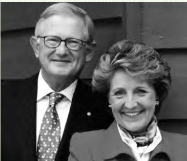
Under the Patronage of Her Royal Highness Princess Margriet of the Netherlands and Professor Pieter van Vollenhoven