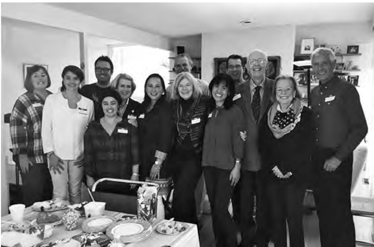
October Luncheon in Lexington, MA.