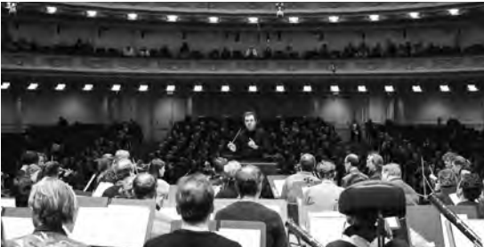
2018 performance of the Royal Concertgebouw Orchestra at Carnegie Hall, Daniele Gatti, chief conductor.