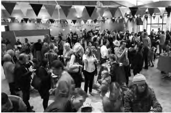
NAF Boston King's Day Celebration at St. Anthony's Parish Church, Cambridge, MA.