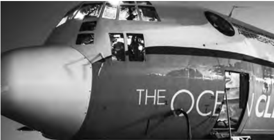
The Ocean Cleanup conducted a series of reconnaissance flights across the Great Pacific Garbage Patch: the Aerial Expedition. The objective of the mission was to accurately quantify the ocean's biggest and most harmful debris, discarded fishing gear called ghost nets. Determining the amount of this large debris is the final stage of mapping the ocean plastic problem.

To support the publication of a Catalogue Raisonné of the Drawings of Aelbert Cuyp: 1620-1691 .