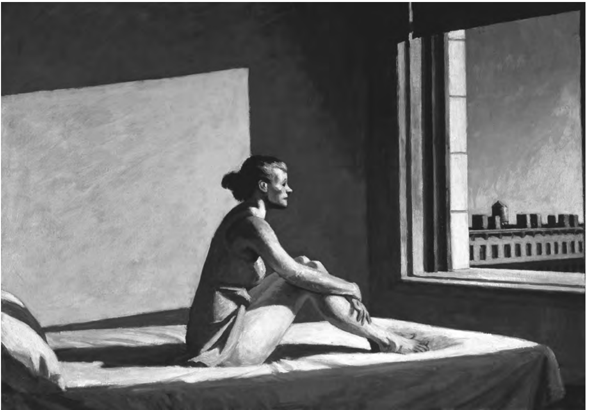
Photo credit: Edward Hopper (1882-1967), Morning Sun , 1952, oil on canvas, Columbus Museum of Art, Ohio: Museum Purchase, Howald Fund