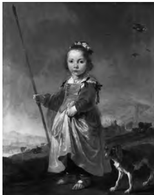
Jan Baptist Weenix, Girl as Shepherdess with Dog , Le Musée de Picardie, Amiens