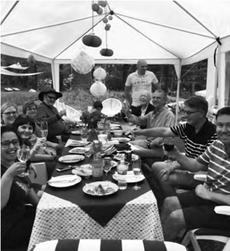
June Luncheon in Lincoln, MA.