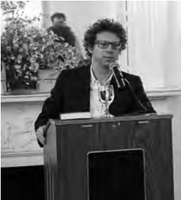
Arnon Grunberg discussing his life and work at the Netherland Club of New York, January 2017.

We thank the authors, their publishers and all of our NAF members and friends who participated in these events.