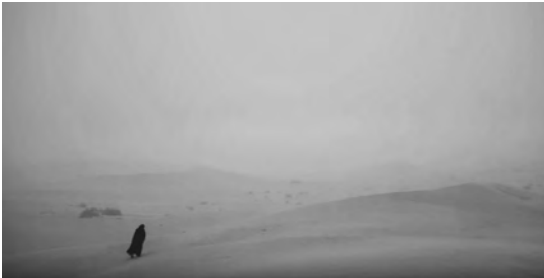
Film still from The Poetess , by filmmakers Stefanie Brockhaus and Andy Wolff (German), 2017. The film was presented as part of the 2017 International Documentary Filmfestival Amsterdam (IDFA).