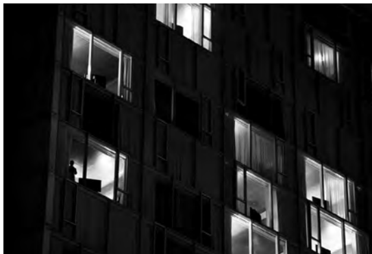
From 150 Psalms, The Standard Hotel and High Line, 2013.