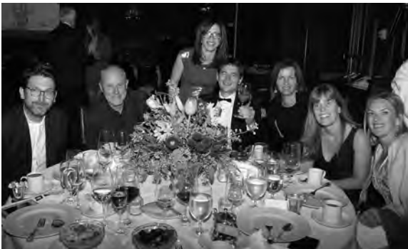
WeTransfer Sponsor table and guests.